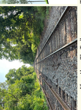
View Along The Trail